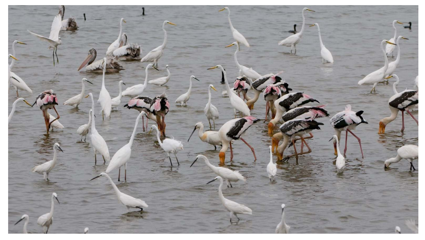
Mixed feeding flock in Bundala National Park.

Feb. 8: Bundala National Park is coastal lagoons, saltpans and scrubland. Here we watched very big mixed flocks of egrets, spoonbills, storks and pelicans fishing in the saltpans. New were Glossy Ibis, Cinnamon Bittern, Western Reef Egret, Eurasian Stone Curlew, Common and Little Ringed Plover, Lesser Sand Plover, Marsh Sandpiber, Oriental and Little Pratincole, Brown-headed Gull, Lesser and Greater Crested Tern, and Common Tern. In the scrubs Chestnut-headed Bee-eater, Ashy Woodswallow, and Clamorous Reed Warbler were new to us.