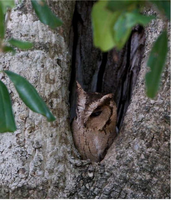
Oriental Scops Owl

Feb. 9 – 13: On the way to Unawatuna Beach for the more relaxing last days of the tour we stopped in a village where Senarath showed us Oriental Scops Owl in a tree by the road.